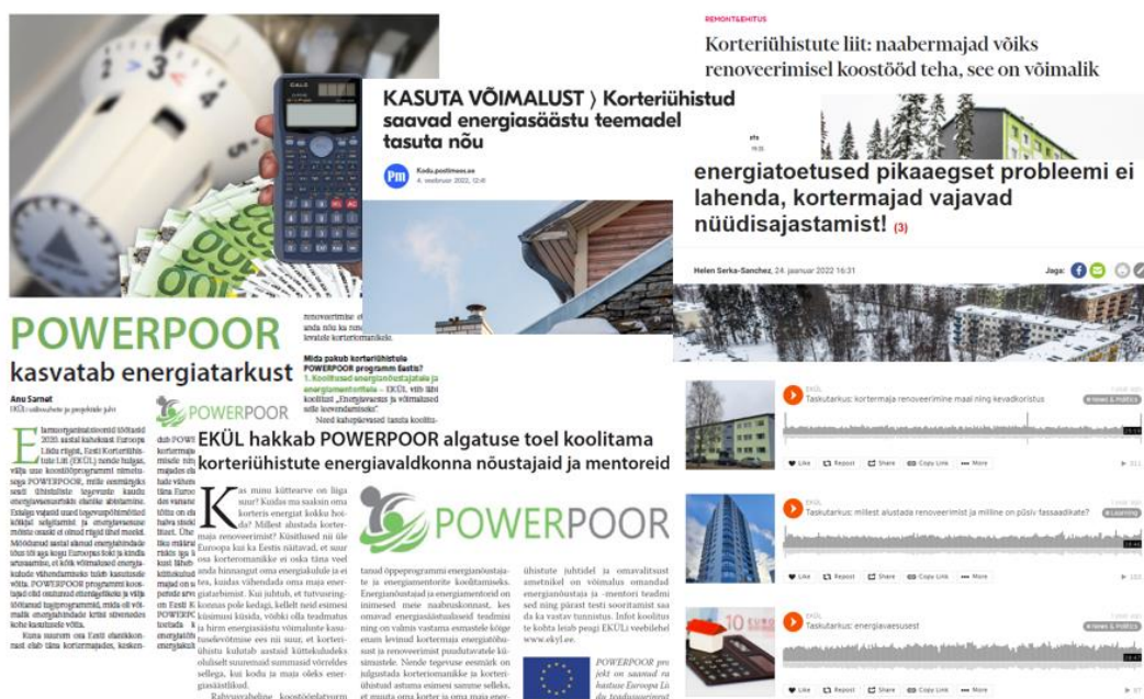
POWERPOOR cooperates with media channels in Estonia to contribute to the public discussion on energy poverty and joint energy initiatives.

As a result of the work of the group, direct connections were created between state institutions and local authorities to work together to alleviate energy poverty and empower joint energy initiatives in Estonia. Also, policy recommendations were developed for Estonia to support energy poverty mitigation and contribute to the new law on energy management issues. Active public discussion was initiated in Estonian media on the definitions of energy poverty and energy community, renovation as a solution for alleviating energy poverty, and challenges with establishing energy communities in Estonia.