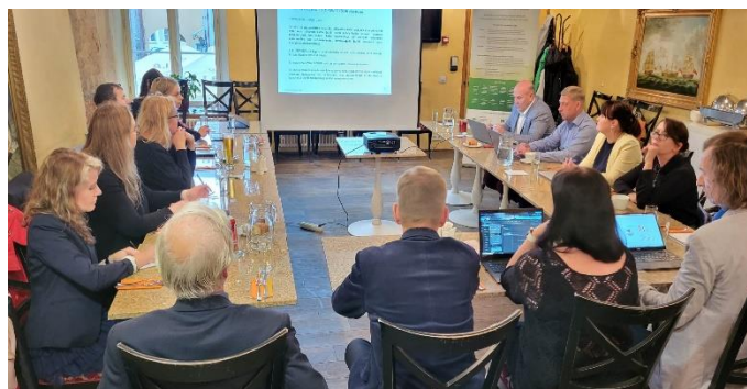
Members of the POWERPOOR stakeholder liaison group participating in the workshop and mapping the situation with energy poverty, and discussing the next steps in cooperation at the meeting in Tallinn.

As a result of the work of the group, direct connections were created between state institutions and local authorities to work together to alleviate energy poverty and empower joint energy initiatives in Estonia. Also, policy recommendations were developed for Estonia to support energy poverty mitigation and contribute to the new law on energy management issues. Active public discussion was initiated in Estonian media on the definitions of energy poverty and energy community, renovation as a solution for alleviating energy poverty, and challenges with establishing energy communities in Estonia.