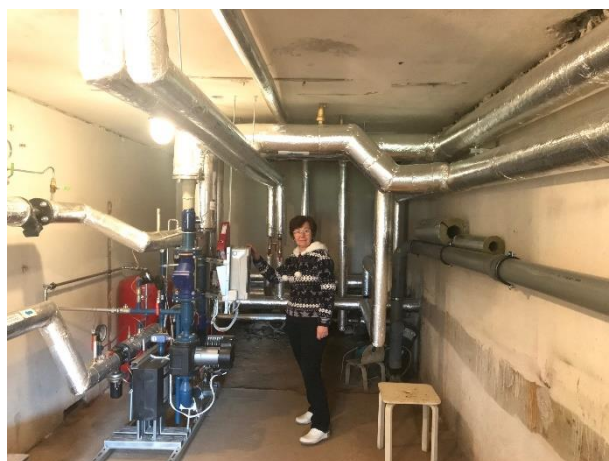
Active energy mentor in the city of Tartu, making home visits and organizing renovation of the heating system of the building.

In close cooperation with the Energy Poverty Alleviation Office established in Tallinn, these energy supporters and mentors, that enumerate to more than 100 altogether, identified energy poor households in the apartment associations during the home visits with the help of the POWERPOOR toolkit, convincing apartment owners to renovate their houses and to start planning for establishing joint energy initiatives, for example, installing solar panels to the building to alleviate energy poverty. Altogether more than 600 households have received