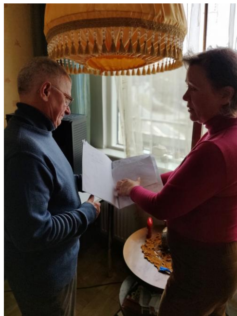
Active energy mentor in the city of Tallinn, making home visits, teaching skills for saving energy at home, and identifying households at risk of energy poverty.